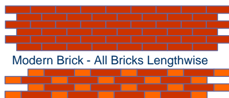
Modern Brick - All Bricks Lengthwise